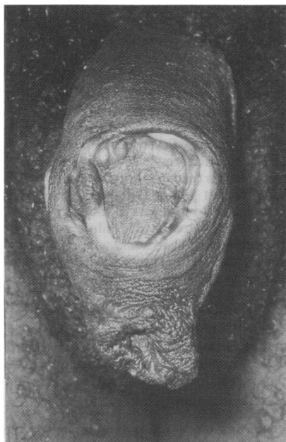
Figure Circular hole (18 mm in diameter) in dorsal aspect of foreskin.

When he attended again in July 1988, he was found to have a large hyperkeratotic wart on the foreskin and a large (18 mm in diameter) well healed circular hole on the