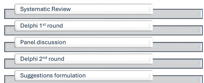
Figure 1 Flowchart of the development of the scenarios, statements and suggestions.

The Delphi method, 13 a consensus-building approach, 14 involved collecting opinions through a procedure ensuring: (a) anonymity—the experts did not know the responses of the other specialists; (b) feedback—the experts could suggest additional