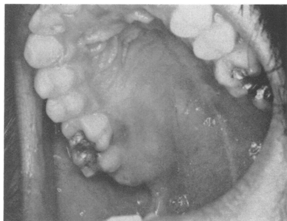
FIG. 1 Case 1. Primary lesion on hard palate opposite right upper second molar

On examination, the oedema and erythema of the oropharynx had completely subsided, but the erosive lesion on the hard palate was unchanged. He complained of feeling a 'lump' on the roof of the mouth, but it did not hurt him. The erosion was non-tender on examination with a gloved finger; the anterior cervical glands were