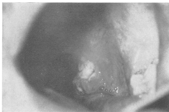
FIG. 3 Case 3. Primary lesion of the left tonsil

The tonsillar area, next in frequency to the lips and tongue, is another common location for oral chancres; there is considerable oedema, redness, and an