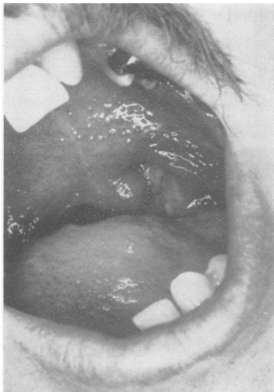
FIG. 2 Case 2. Primary lesion of the left tonsil

Case 3, a 28-year-old male homosexual , attended on July 8, 1973. His history mimicked that of Case 2 in that he was a contact of a patient with secondary syphilis and his only complaint was a lump in the left side of the throat (Fig. 3). The findings on examination were exactly the same as in Case 2.