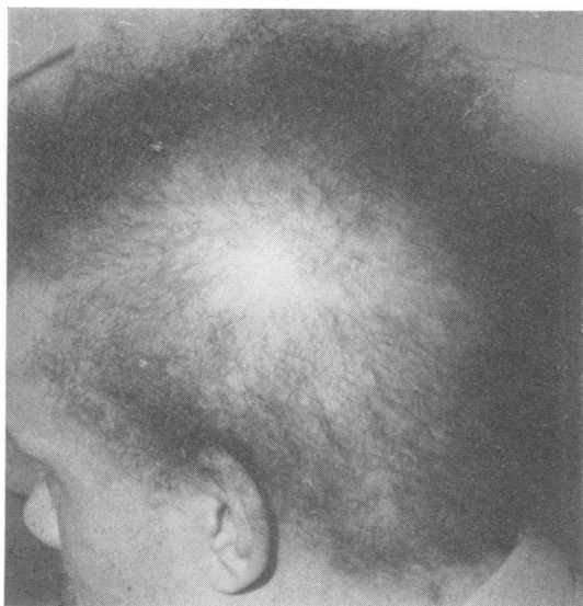
Fig. 2 Diffuse and extensive alopecia caused by Jarisch-Herxheimer reaction six hours after first injection of penicillin.