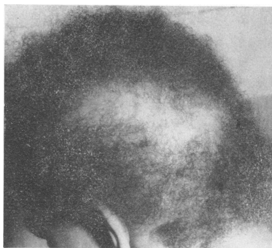
Fig. 1 Syphilitic alopecia showing 'moth eaten' appearance.

The patient's full blood count was normal and the erythrocyte sedimentation rate was 10 mm in the first hour (Westergren). Thyroid function tests, blood sugar, lupus erythematosus cells, and serum