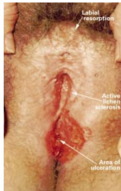
Figure 1 Appearance of the vulva—ulceration remains despite therapy for HSV. Note white plaques, small haemorrhages, and labial resorption typical of lichen sclerosis.

EDITOR,—Lesions that fail to heal despite appropriate therapy should always be biopsied to look for an underlying diagnosis. We have seen a 44 year old woman who presented with genital ulceration and lichen sclerosis and was culture positive for herpes simplex virus (HSV) type 1. After treatment with two courses of oral aciclovir there was some reduction in ulceration and resolution of symptoms. However, in view of the persisting solitary ulcer and the presence of lichen sclerosis (fig 1) a biopsy was performed. Histology was reported as showing poorly differentiated invasive squamous cell carcinoma with vulval dystrophy but no features of wart virus infection. She was promptly referred to the gynaecological oncology department where local radiotherapy and chemotherapy were the initial treatments of choice as the tumour extended close to the anal margin. The immediate response was encouraging but subsequently vaginal adhesions and difficulty with micturition developed. A pelvic CT scan showed bilateral inguinal node involvement (fig 2). Radical block dissection was subsequently performed but lymphoedema and local skin nodules developed and she died 2 years after diagnosis.