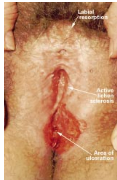
Figure 1 Appearance of the vulva—ulceration remains despite therapy for HSV. Note white plaques, small haemorrhages, and labial resorption typical of lichen sclerosis.

EDITOR,—Lesions that fail to heal despite appropriate therapy should always be biopsied to look for an underlying diagnosis. We have seen a 44 year old woman who presented with genital ulceration and lichen sclerosis and was culture positive for herpes simplex virus (HSV) type 1. After treatment with two courses of oral aciclovir there was some reduction in ulceration and resolution of symptoms. However, in view of the persisting solitary ulcer and the presence of lichen sclerosis (fig 1) a biopsy was performed. Histology was reported as showing poorly differentiated invasive squamous cell carcinoma with vulval dystrophy but no features of wart virus infection. She was promptly referred to the gynaecological oncology department where local radiotherapy and chemotherapy were the initial treatments of choice as the tumour extended close to the anal margin. The immediate response was encouraging but subsequently vaginal adhesions and difficulty with micturition developed. A pelvic CT scan showed bilateral inguinal node involvement (fig 2). Radical block dissection was subsequently performed but lymphoedema and local skin nodules developed and she died 2 years after diagnosis.