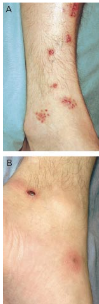
Figure 1 (A) At initial presentation with MAC infection. Patient’s right shin and ankle showing painless dermal papules and nodules. A skin biopsy has been performed on the right shin. (B) Five days after re-presentation. Medial aspect of left ankle. There are two erythematous lesions, which were tender to touch. Both have a pustular centre.

A 40 year old white HIV positive man presented with Staphylococcus aureus tricuspid valve endocarditis: blood cultures also grew MAC. He had a history of cutaneous