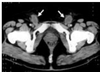
Figure 2 Pelvic CT scan showing bilateral inguinal lymphadenopathy.

Vulval cancer accounts for 3–5% of female genital tract malignancies. Risk factors include lichen sclerosus, vulval intraepithelial neoplasia, and infection with oncogenic human papillomavirus (HPV) types. 1 STDs other than HPV are also associated with an increase in the risk of developing vulval neoplasia. 2 The presence of antibodies to HSV type 2 has been implicated as a risk for cervical pathology 3 but a role for HSV in vulval neoplasia is unclear. Vulval basal cell carcinoma presenting as culture negative genital herpes has been reported. 4 In our case the carcinoma was culture positive for HSV; this may have been due to new infection or to reactivation of pre-existing HSV in the presence of malignancy. This case highlights the need for biopsy of herpetic lesions which fail to respond to standard therapy.