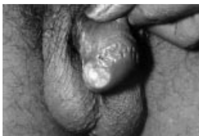
Figure 1 Glans penis showing both ulcer and puckered scarring.

On physical examination, this moderately nourished individual had a single well defined ulcer on the glans penis near the urethral meatus, measuring 8 × 5 mm. The edge of the ulcer was undermined and its floor had necrotic slough. The ulcer had perforated deeply into the urethra, resulting in dribbling of urine through it (fig 1). Multiple puckered scars over the glans penis circumferentially, just distal to the coronal sulcus, were evidence of previous episodes of similar ulcerations. The inguinal lymph nodes were not significantly enlarged. His systemic examination was unremarkable.