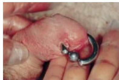
Figure 1 A Prince Albert ring inserted through the external urethra and glans penis.

Genital piercing is becoming more fashionable in the Western world and is performed to enhance sexual pleasure and also for cosmetic effect. It was traditionally practised in the tribal population of India and Africa, mostly for ritual and cultural reasons. Metal or ivory studs or rings or bars are commonly used. The metals can be made of steel or various other alloys containing iron, copper, zinc, and