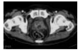
See p 144.