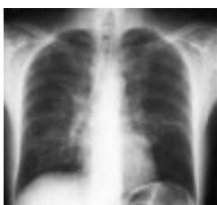
See p 88