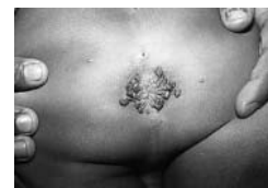
See p 424

362 Echo: Young injecting drug users have a high incidence of hepatitis C