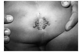
See p 424