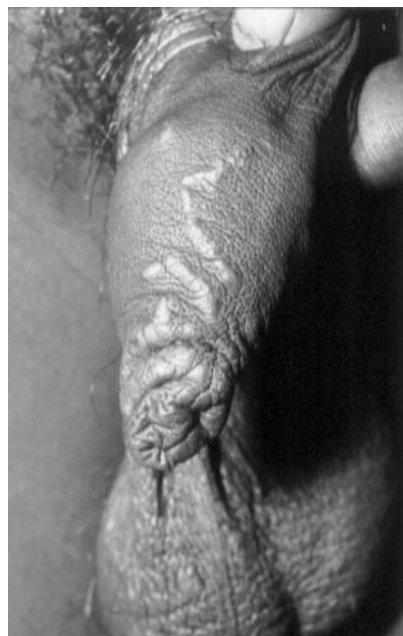
Figure 1 A linear serpentine lesion seen extending from the tip of the prepuce on to the shaft.

Cutaneous larva migrans (CLM) is a distinctive cutaneous eruption caused by the invasion and migration of larva of parasites in skin. 1 It is also known by various other