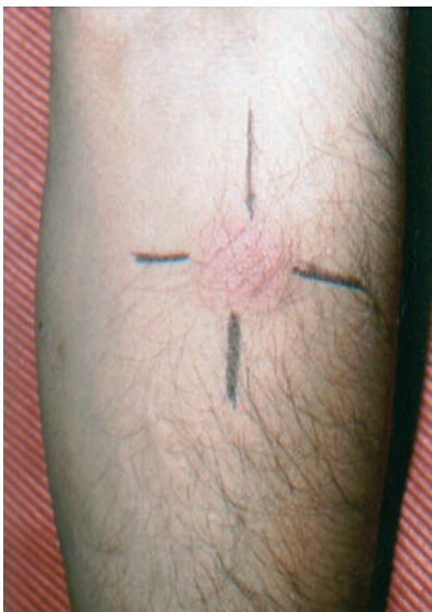
Figure 2 Forearm showing positive Mantoux reaction.

palpation. The prostate was normal on rectal examination.