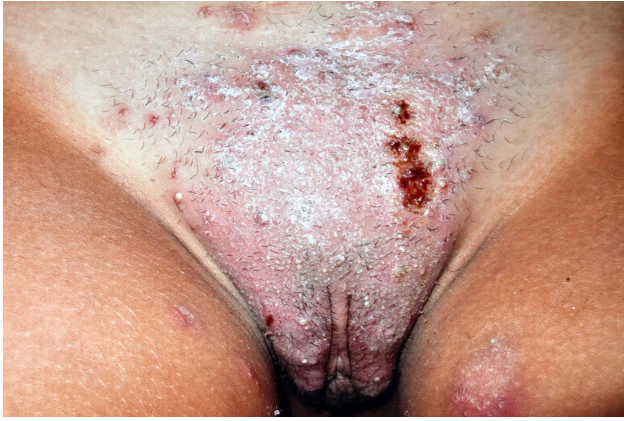
Figure 1 Erythematous scaling plaques and follicular pustules in an 18-year-old patient.

hospitalised for a total of 14 days. After 6 weeks of itraconazole and 3 weeks of prednisone, the lesions healed with marked scarring.