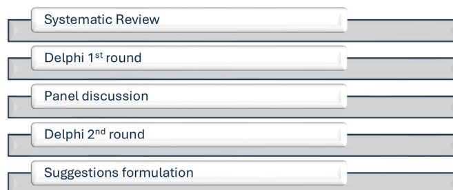
Figure 1 Flowchart of the development of the scenarios, statements and suggestions.

The Delphi method, 13 a consensus-building approach, 14 involved collecting opinions through a procedure ensuring: (a) anonymity—the experts did not know the responses of the other specialists; (b) feedback—the experts could suggest additional